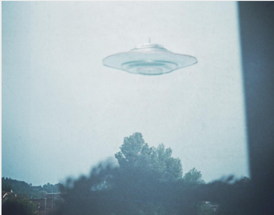
20th May 1975, 15:00 hrs Wihaldenstrasse 10, Hinwil Semjase's beamship over Wihaldenstrasse in Hinwil, heading north. The ship is semi-transparent. The proximity of the ship and its vibrations may have impaired the quality of the film.