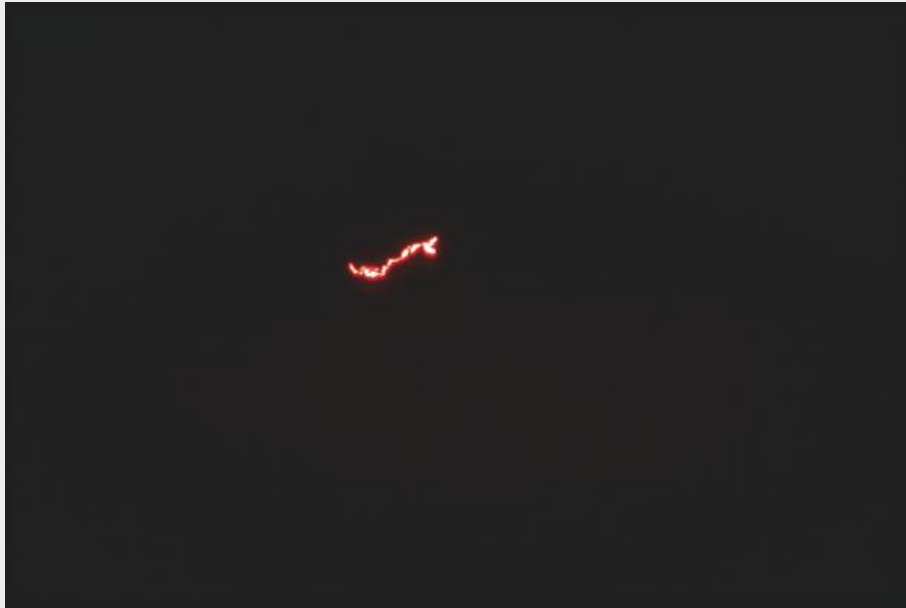
Semjase's beamship at night demonstration.

Great, I will be happy to see him again. – Ah – we were able to take photos and films of your ship about ten days ago at night. We got quite good light effects on the films. It would be very useful if we could roll one more film. Would that be possible?