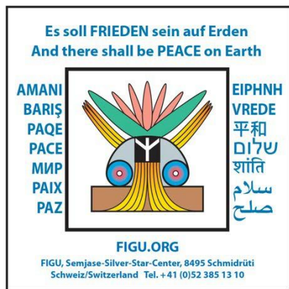
The peace symbol