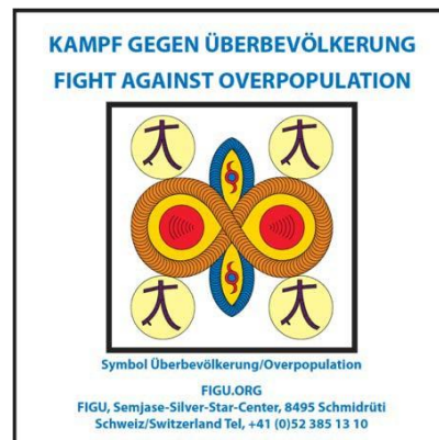
Primal Symbol Overpopulation