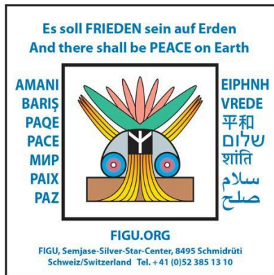
The peace symbol

Car Glue Adhesive sizes 120x120 mm = CHF 3.- 250x250 mm = CHF 6.- 300x300 mm = CHF 12.