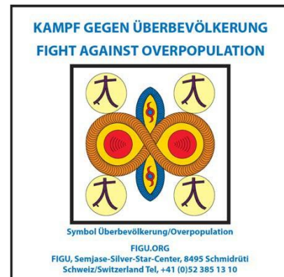
Primal Symbol Overpopulation

Order against prepayment: FIGU Hinterschmidrüti 1225 Schmidrüti / Switzerland