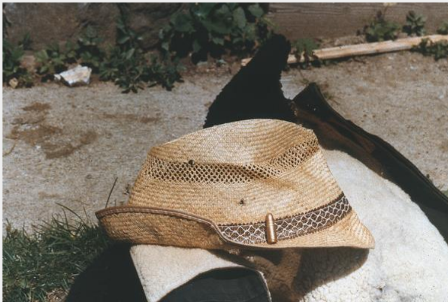
The hat that Billy shot off the shooter's head. You can clearly see the bullet hole in the hat.