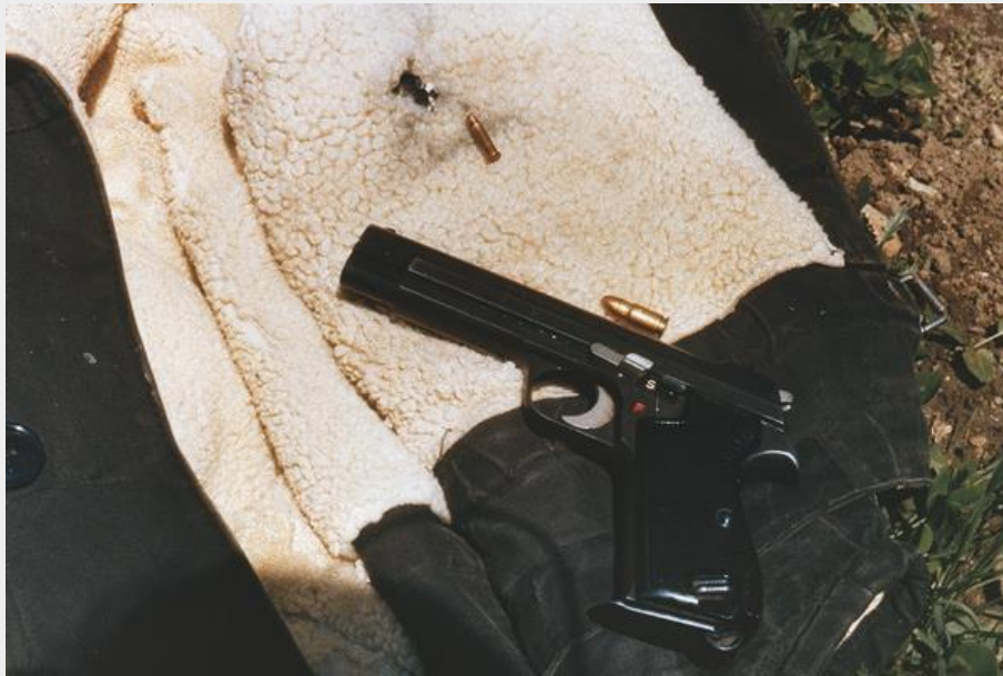
Billy's jacket and his gun. Clearly visible in the upper centre of the picture the rejection point.